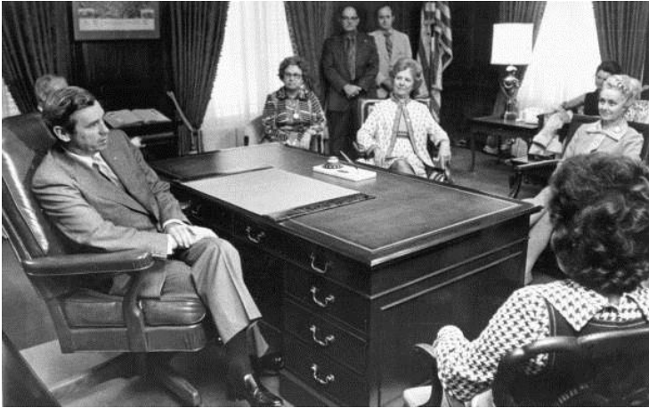
Governor Reubin Askew meets with a delegation of Floridians, 1972

These series originate from the Governor's Office and include: correspondence, meeting, administrative, survey, budget, subject, conference, and nomination files on women's issues. The series were created by the governors and their wives, staff members and appointed cohorts. Records that document the work of relevant commissions are also included here due to their creation by executive order and administrative position within the Office of the Governor.