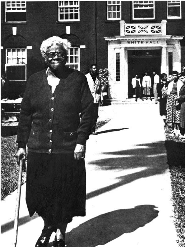
Mary McLeod Bethune in front of Bethune-Cookman College's White Hall, ca. 1940s