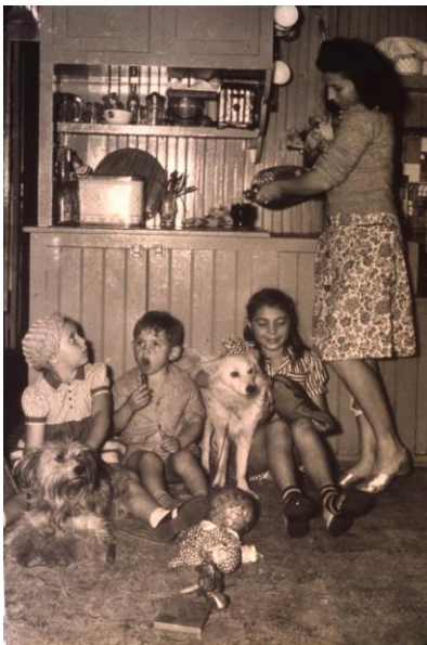
In the kitchen with mother and kids, not dated