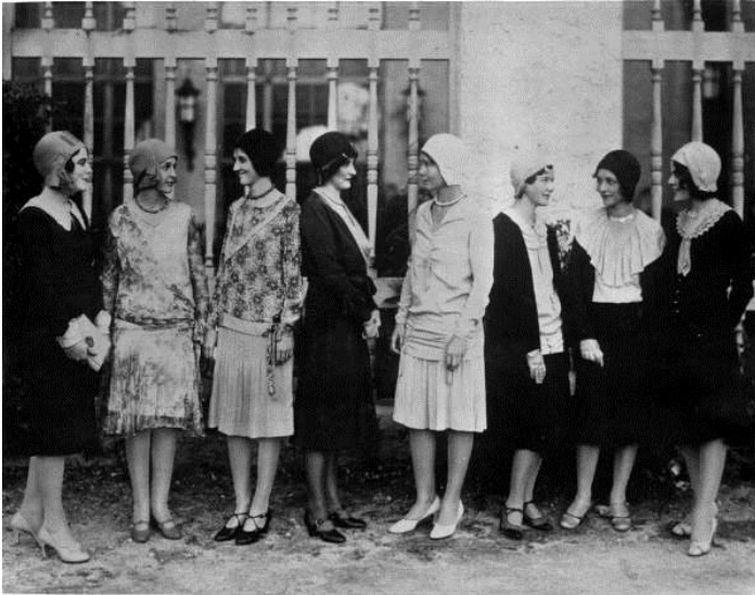
Junior Women's Club of Miami Officers, 1927

These collections consist of the working papers, such as: membership rolls; minutes; applications; and memorabilia of various women's professional, charitable and historical associations and clubs. Also included in this section are the papers of multiple businesses that document women, either administratively or as part of the business' program.