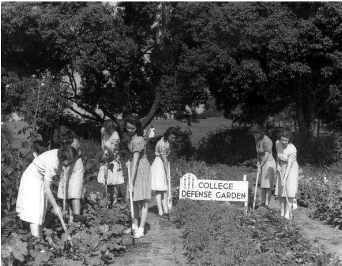
Students tending the Florida State College for Women’s College Defense Garden, 1942

This section is organized by the agencies that created the listed records, then by the different categories of records, or “record series,” created by each agency relating to women’s history and women’s issues in Florida. Some agencies have several series listed due to their frequent involvement in projects, initiatives and everyday work relating to women. Several series document women in high levels of management, such as: Secretary of State; Secretary of Administration; State Librarian and Archivist; and Chancellor of the Board of Regents. A number of series concern education for women in Florida, including several from the Florida State College for Women, predecessor to Florida State University, and several series pertaining to equal educational and employment opportunities for women at Florida public universities. Women’s rights and health issues are addressed through collections documenting voting rights, the Equal Rights Amendment, equal employment opportunities for women, family planning, and midwifery.