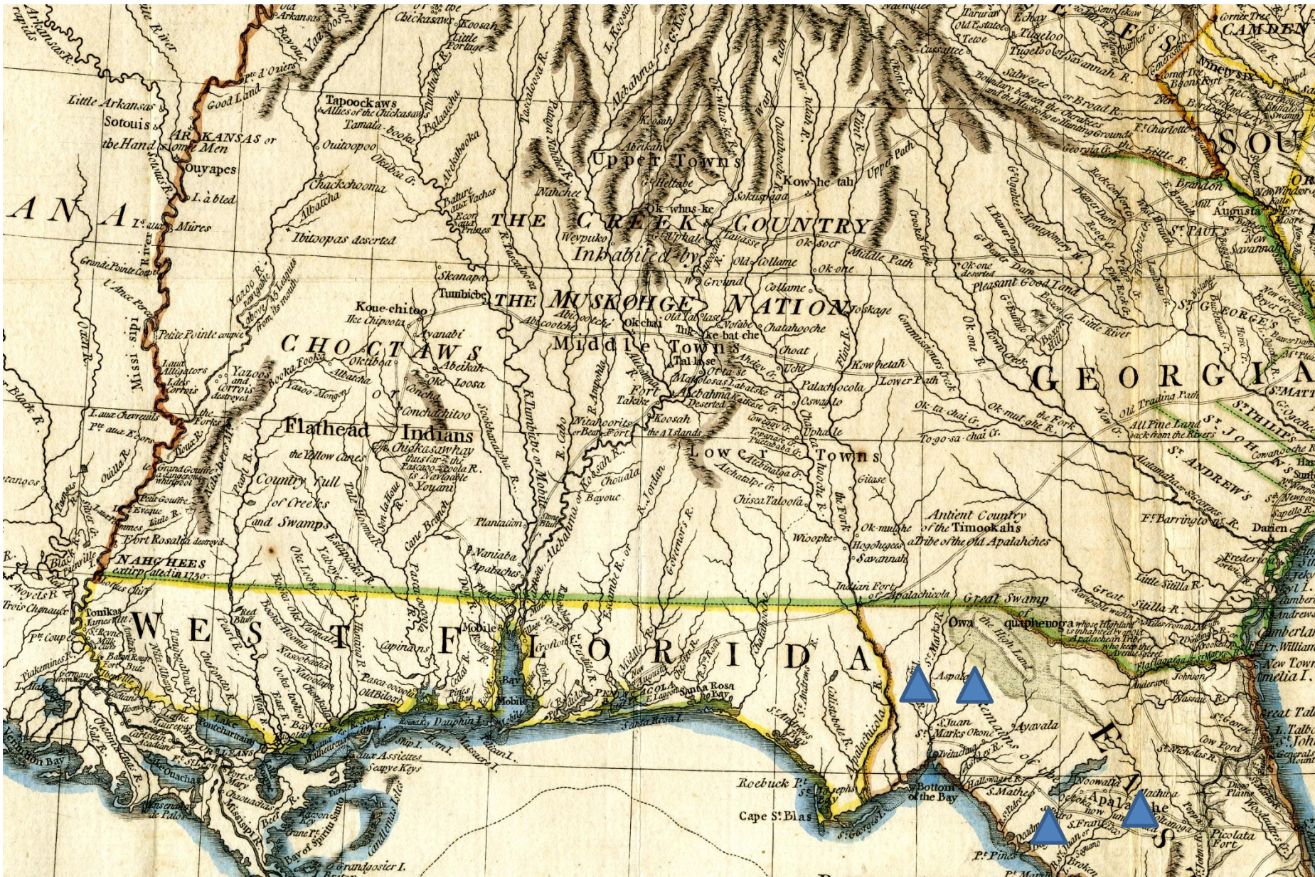
Lower Creeks Migrate Into Florida