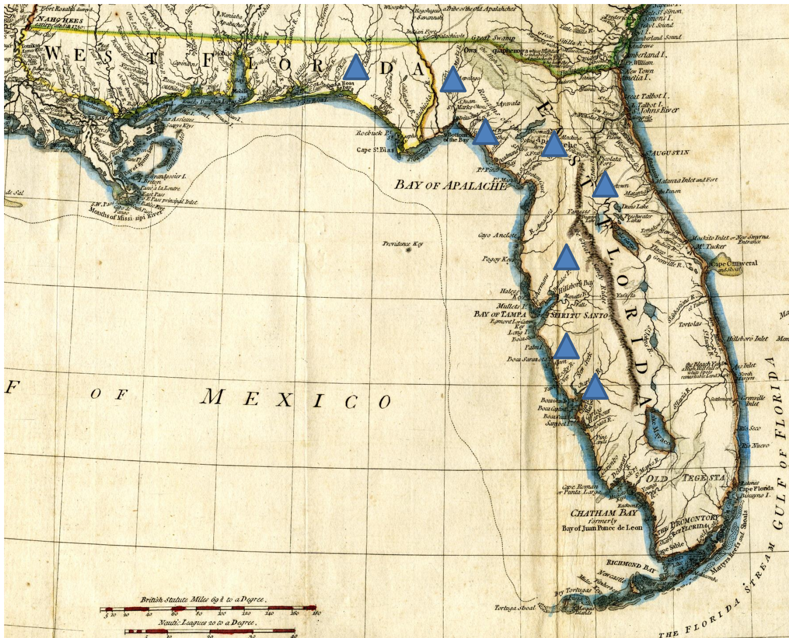
Seminoles, by 1800