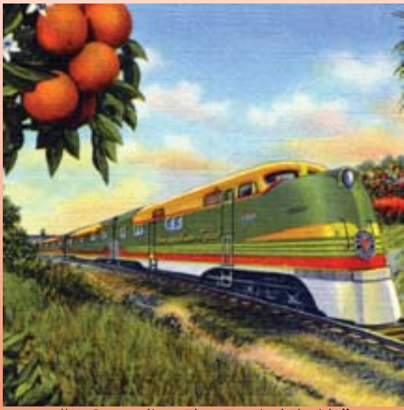
"By Streamliner Thru Tropical Florida" (Postmarked January 1, 1948)

The State Library and Archives of Florida collects, preserves, and makes available the documentary history of the state.